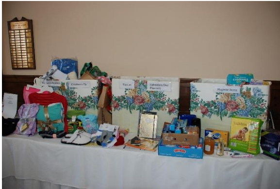
A display of items donated to the Helen Ross McNabb Family Crisis Center